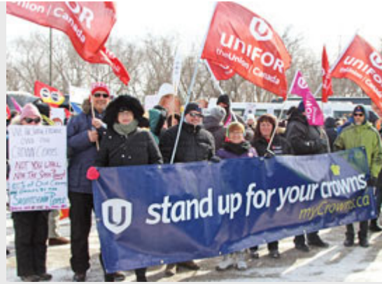
Unifor celebrates victory as the conservative government in Saskatchewan officially backs off of privatizing Crown corporations.